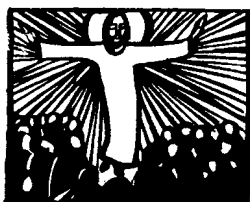
And He came down with them and stood on a stretch of level ground. Lk. 6:17, 20-26

Christ is the first fruits of those who have fallen asleep. If Christ were not raised from the dead, our faith would be in vain.